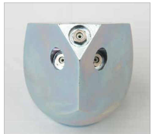
Raut 1" with ceramic inserts